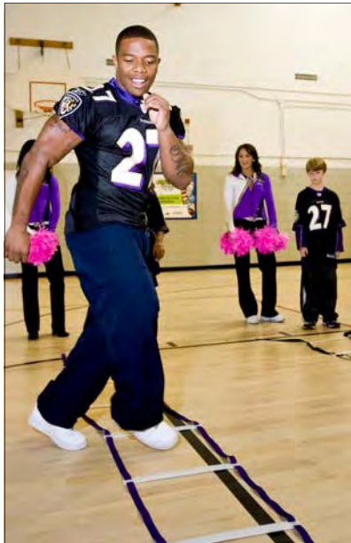
At Cockeysville Middle School, RB Ray Rice showed off his fancy footwork while encouraging students to stay active.