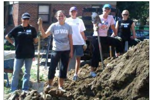
Lady Ravens conquered a mound of soil.