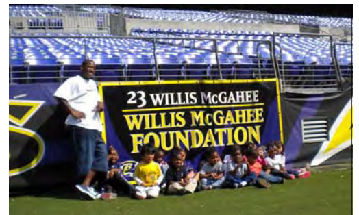
RB Willis McGahee poses by his foundation banner with a group of young fans.

On Tuesday (9/15), Willis McGahee gathered 30 youth from Howard County for a tour of M&T Bank Stadium. McGahee, a resident of Howard County, has been named the 2009 Humanitarian of the Year by the Howard County Community Council for his efforts through the Willis McGahee Foundation.